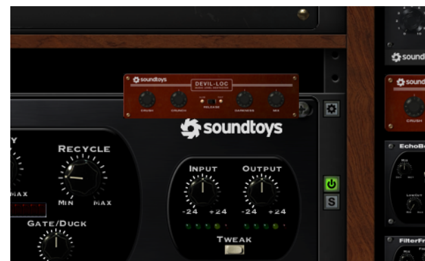
Figure 4: Inserting above an existing Rack item

of Devil-Loc above Crystallizer would look before it is secured into the rack: