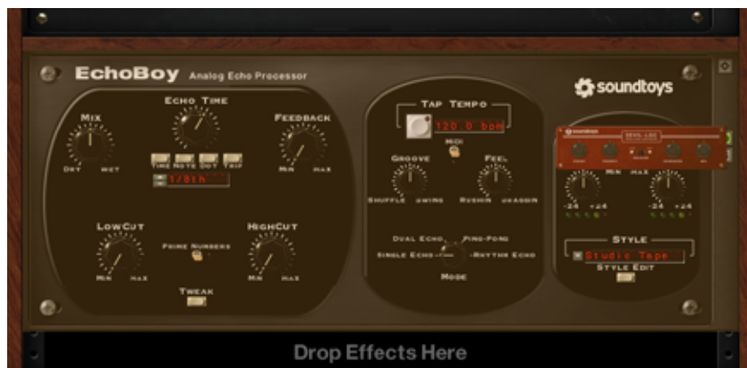
Figure 5: Replacing a Rack item

You can also swap out rack pieces where the newly inserted piece of gear will take the place of an existing piece and remove it from the rack. To do this, simply drag your new item to the Rack and center it over the piece of gear you would like to replace. You will see that the entire effect to be replaced will be highlighted yellow (as shown in Figure 5 below)