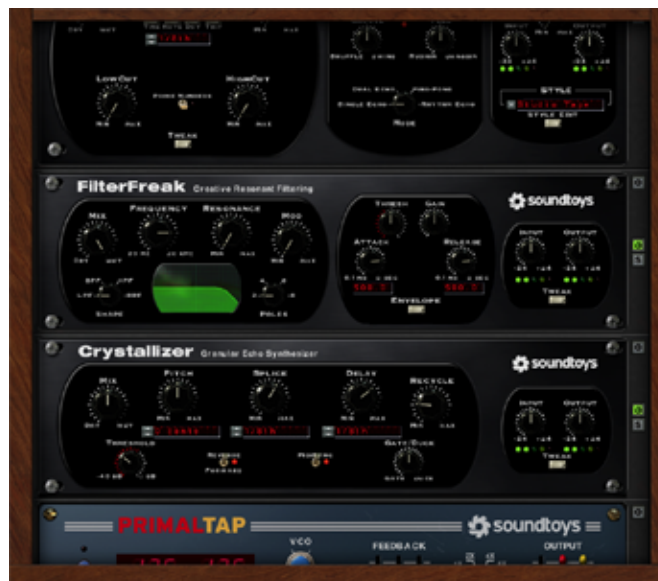
Figure 3: Soundtoys Effect Rack's Rack - Loaded!