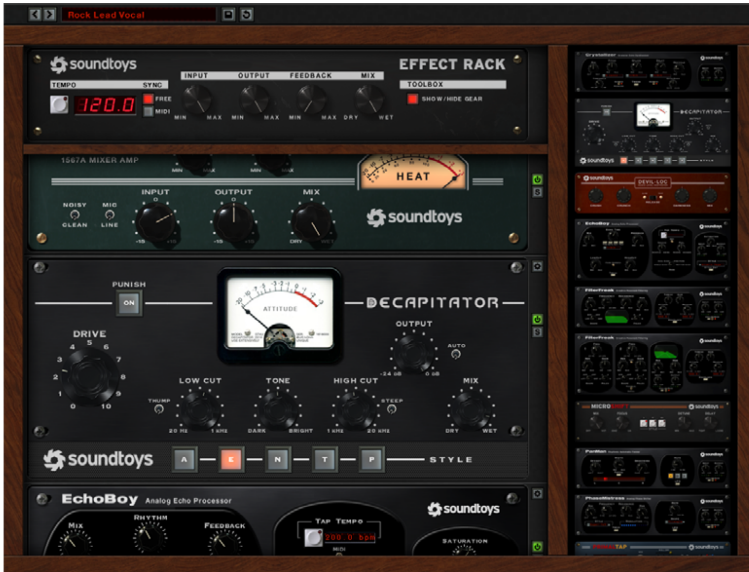
Figure 1: Soundtoys Effect Rack loaded up and ready to go!