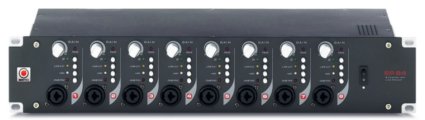
EP84 front panel

* Note: Please take into consideration ventilation of your equipment. A well-ventilated equipment rack will ensure optimum operation and longevity of your equipment. It's often a good idea to leave 1 free rack-bay position between your equipment to allow ventilation As to avoid overheating, please do not place the EP84 on high temperature devices such as power amplifiers.